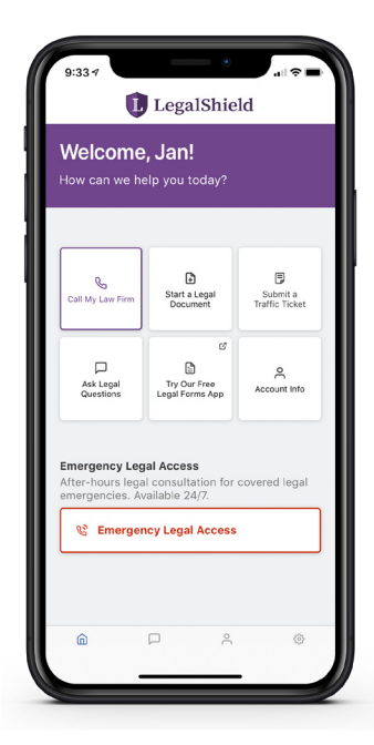
Directly call your law firm